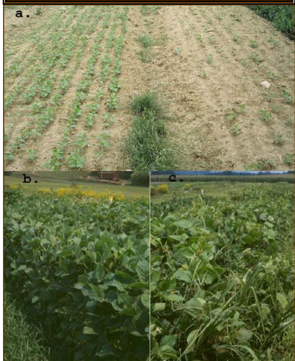
Poor seed quality—seen at emergence and full growth

Many growers are looking to source seed for the upcoming winter crop. It is important to make sure that the seed you are planting is high quality, with zero contamination of undesirable pests, diseases or weeds.